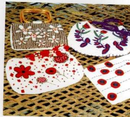
Bag (different types)