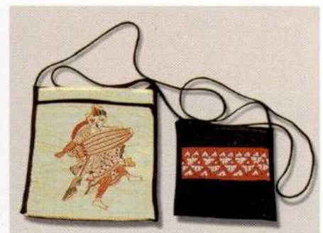
Ladies Side Bag

Hanky, top, kuarti, dopatta, frock different types of shopping bags and ladies purse.