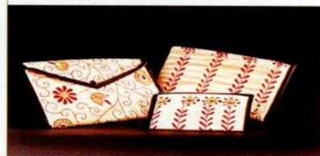
Ladies Purse (different size)